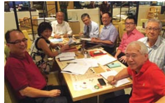
First meeting of members of the Adjudication Panel to decide on the contents of The Old Frees' Association, Singapore coffee-table book, Live Free.