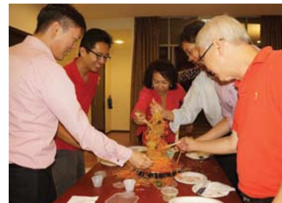
Doing the traditional Prosperity Toss or lo hei.