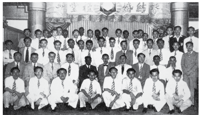
Old Frees in Singapore, 1950s.