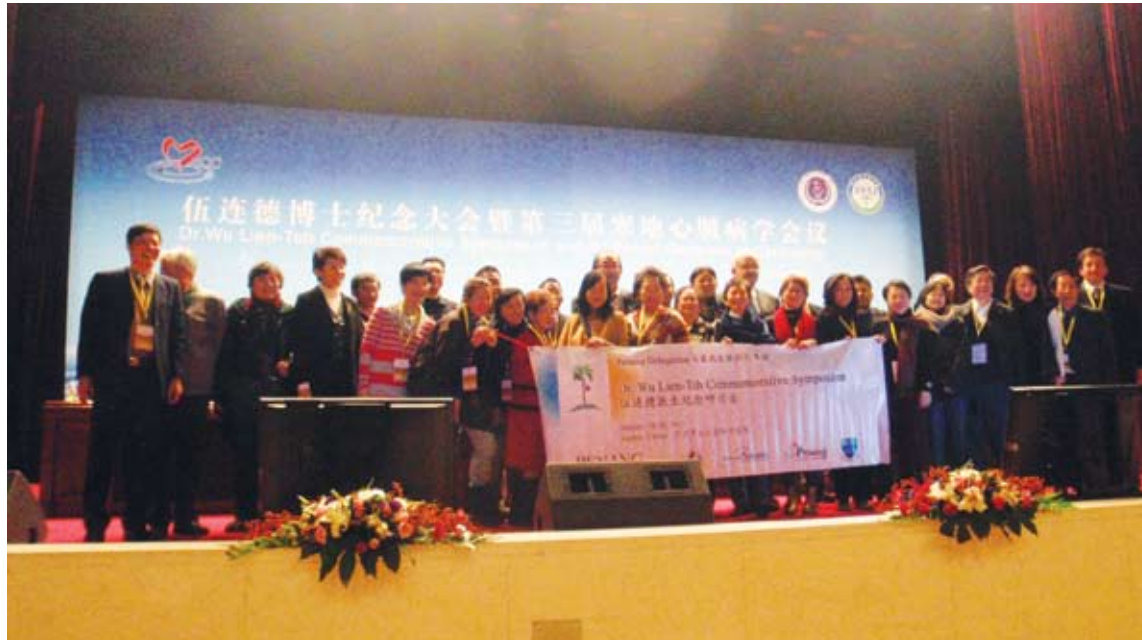
OFAS' 50th anniversary ended on a high note with a trip to Harbin to learn about Dr Wu Lien-Teh's life and work in China.

House Tutor of the Wu Lien-Teh House, one of five Houses on the campus named after key medical figures.