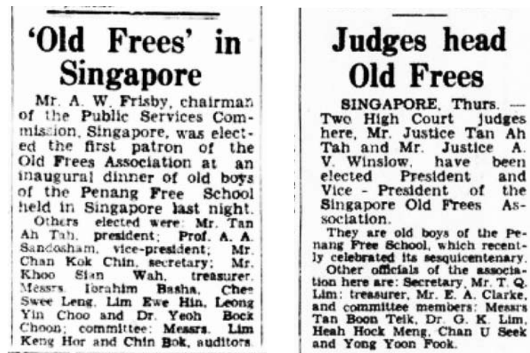
The Straits Times , 22 October 1952 (left) and 28 October 1966.