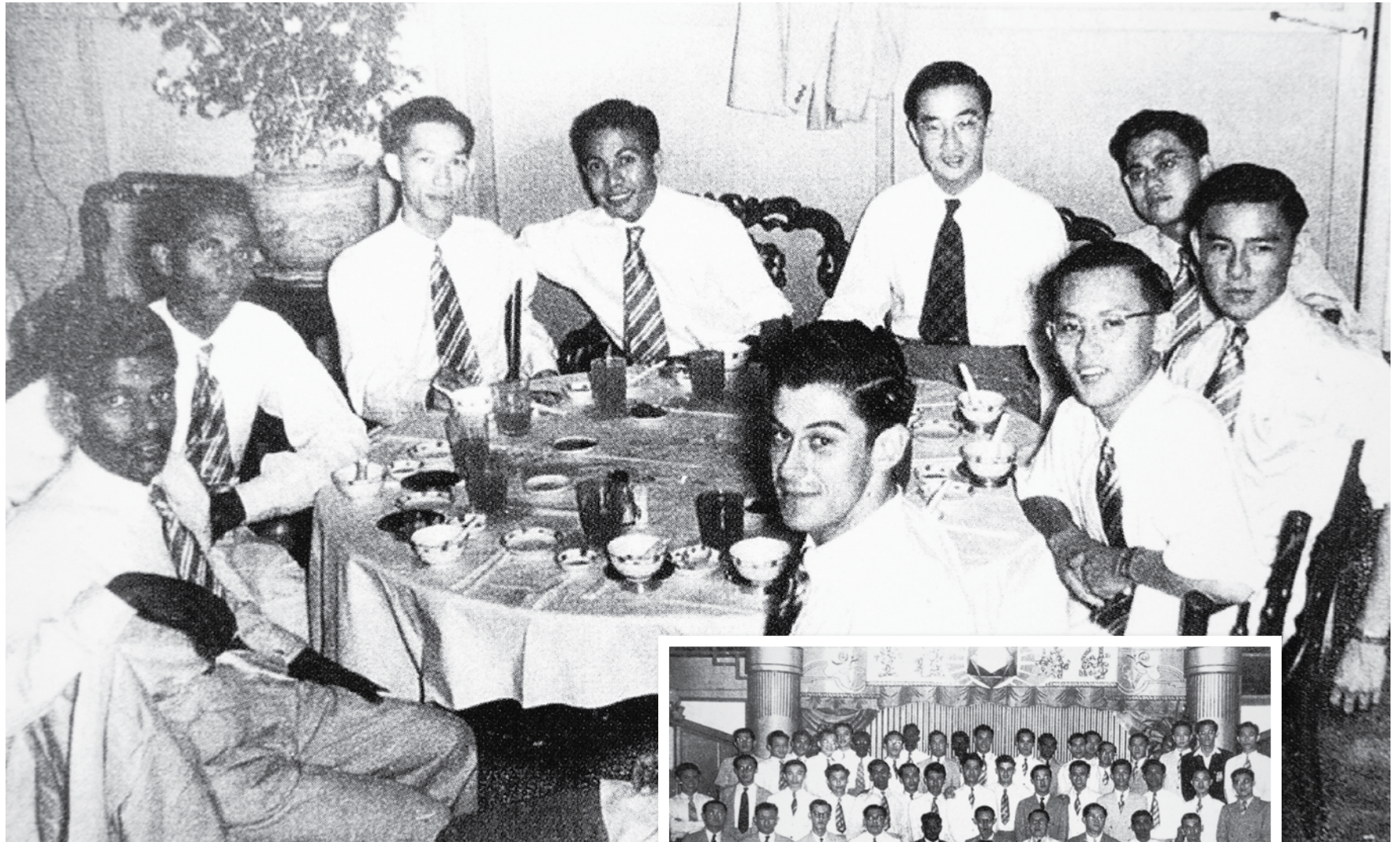
An Old Frees' dinner in Singapore, 1950.